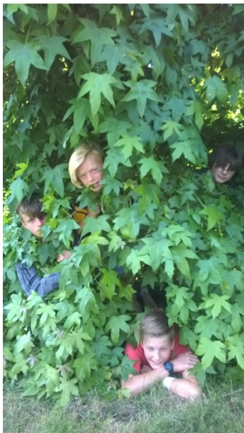
Strange things in the trees at Bedgebury!