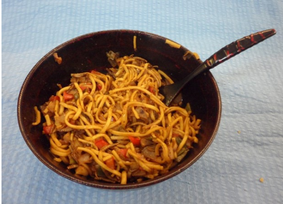
Mealworm Stirfry anyone?