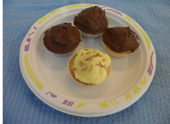
Cakes with extra protein!