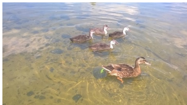
Ducks at Bedgebury