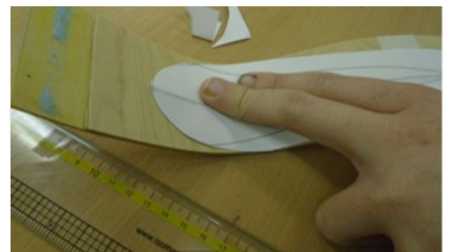
Making the salad servers