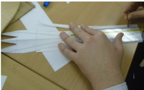
They refined their ideas and made templates