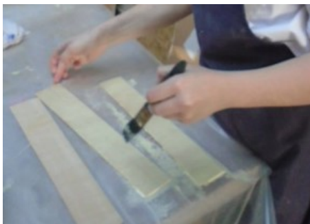
They used a bagpress to make their own shaped servers