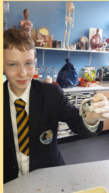
Dissecting the eye!!

Lastly, best of luck to the Year 11s in their exams from the Science department.