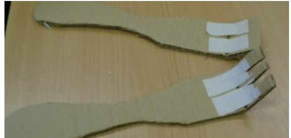
Students made card models to test their ideas

Design is human centred and designers need to ensure that products are the right size for the user and therefore comfortable to use.