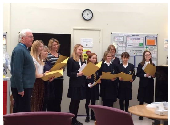
The Ladies Choir at Bexhill Hospital.

In addition, at the end of November, the Ladies Choir visited Bexhill Hospital and delivered a short concert of seasonal songs for the stroke patients in the Irving Unit. This engagement is an annual event and it was very well received by both patients and staff alike.