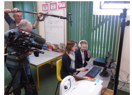
Patoss filming taking place with a Year 8 student

One of the Year 9 classes also had the honour of having one of their lessons filmed recently for Patoss (Professional Association for teachers and assessors of students with Specific Learning Difficulties), who approached us through the BDA (British Dyslexia Association) about filming best practise of dyslexia friendly teaching. The BDA will be using the footage in a documentary about how teachers can support people with Dyslexia. They managed to charm the film crew as well as showing off their fantastic knowledge – well done Year 9.